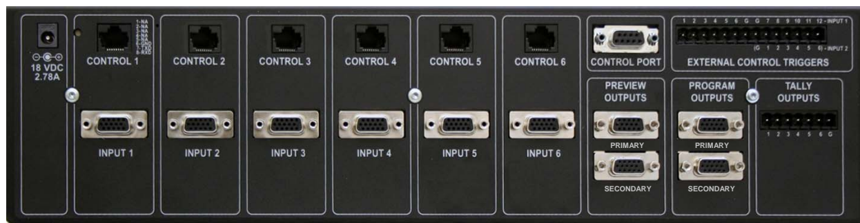
Figure 3: Back panel section of ProductionVIEW HD