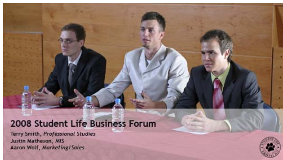
Lower Screen Graphic covering one-third of the screen, with a transparency level of 50%