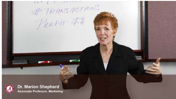
Figures 8, 9, 10 & 11: Simulated pictures of Lower Screen Graphics feature.