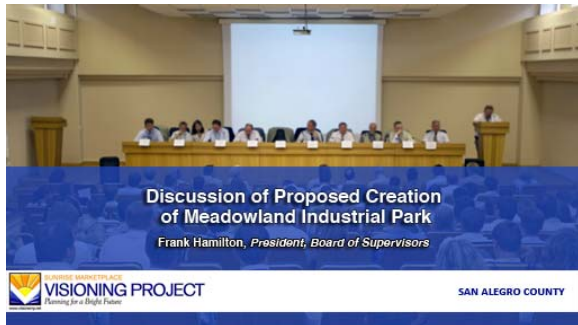
Lower Screen Graphic covering one-half of the screen, with a transparency level of 75%