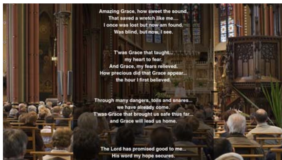
Lower Screen Graphic covering the entire screen, with a transparency level of 50%