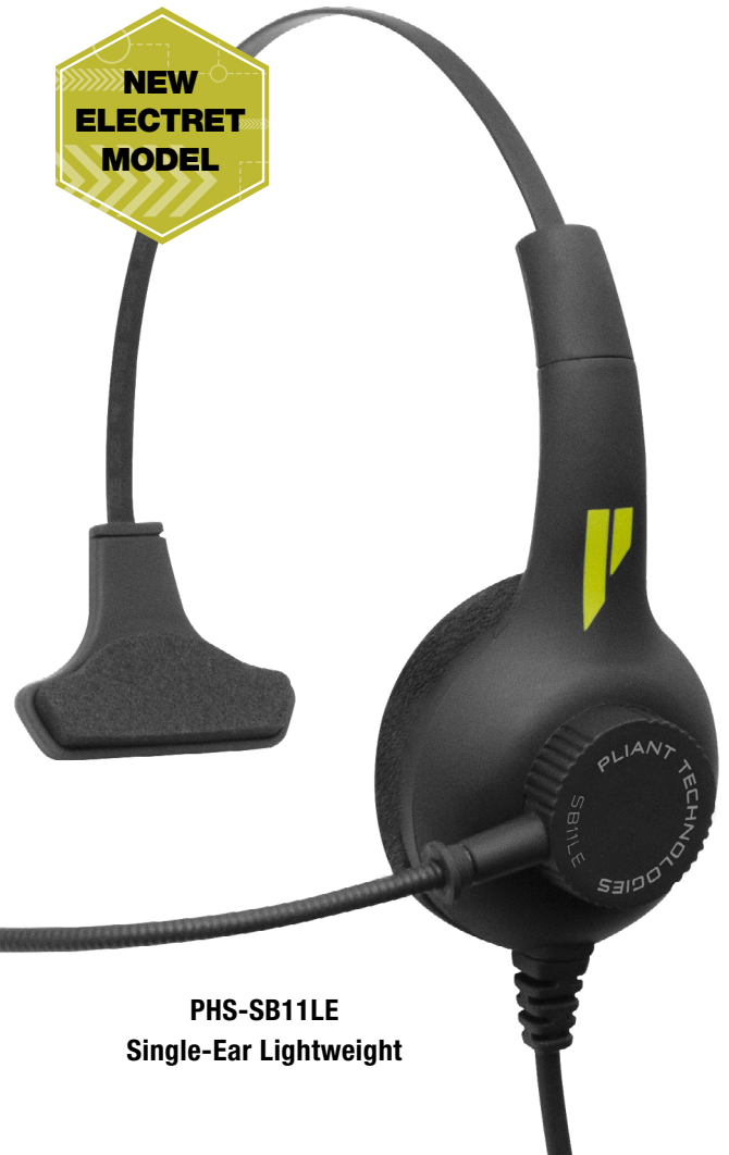
PHS-SB11LE Single-Ear Lightweight

SmartBoom LITE headsets put the latest communication innovations into the hands of professionals. Designed into a smaller form factor, these lightweight headsets are useful for challenging applications where comfort, dependability, and intelligibility are crucial. In addition to the innovative SmartBoom microphone mute function, SmartBoom LITE headsets incorporate a closed-back, single on-ear design featuring a new ear cushion for added on-ear stability and comfort. The headset also features a flexible boom that includes an electret noise-canceling unidirectional microphone optimized for clear voice communications. PHS-SB11LE-DM model is only for use with MicroCom™ products.