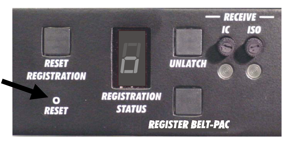
Figure 1. Registration buttons and indicator on left front panel of base station

NOTE: To press the RESET button, insert a small paper clip or similar object into the RESET hole.