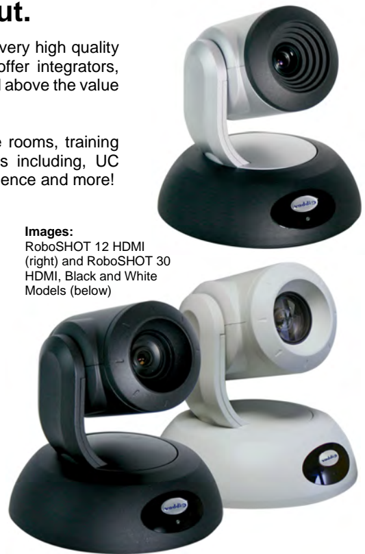
Images: RoboSHOT 12 HDMI (right) and RoboSHOT 30 HDMI, Black and White Models (below)