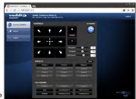
Image: Example of Built-in Camera Control Web Page

The RoboSHOT cameras were designed for the times and represent a new era in specifying and integrating professional quality cameras into A/V and conferencing system configurations. In short, it has never been easier to integrate cameras into any project than with the RoboSHOT HDMI cameras