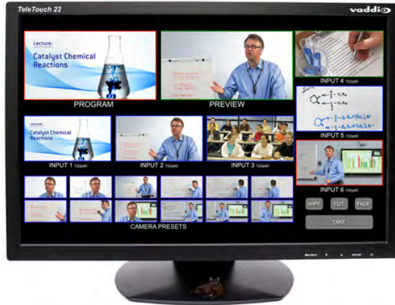
Image: TeleTouch 22" Multiviewer Touch Screen (P/N 999-5520-022)