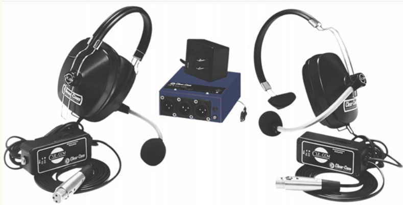
Que Comm Single-Channel Intercom System

Que-Com intercom systems are a compact, cost-effective, portable solution to many intercommunications needs. It consists of a PK-7 intercom power supply, and a choice of either one-ear (SMQ-1) or two-ear (DMQ-2) headset stations with an integral boom mic, attached to a rugged beltpack housing the electronics. Que-Com systems are compatible with all other Clear-Com party-line intercom products.