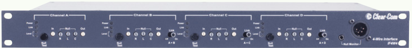
IF4W4 front view

The IF4W4 modular 4-wire interface connects camera intercoms, two-way radios, fiber optics, and other 4-wire devices to a standard Clear-Com intercom line. The 1-RU chassis holds up to four individual interface modules, each with its own 4-wire terminal block and XLR-3M connector to interface with Clear-Com.